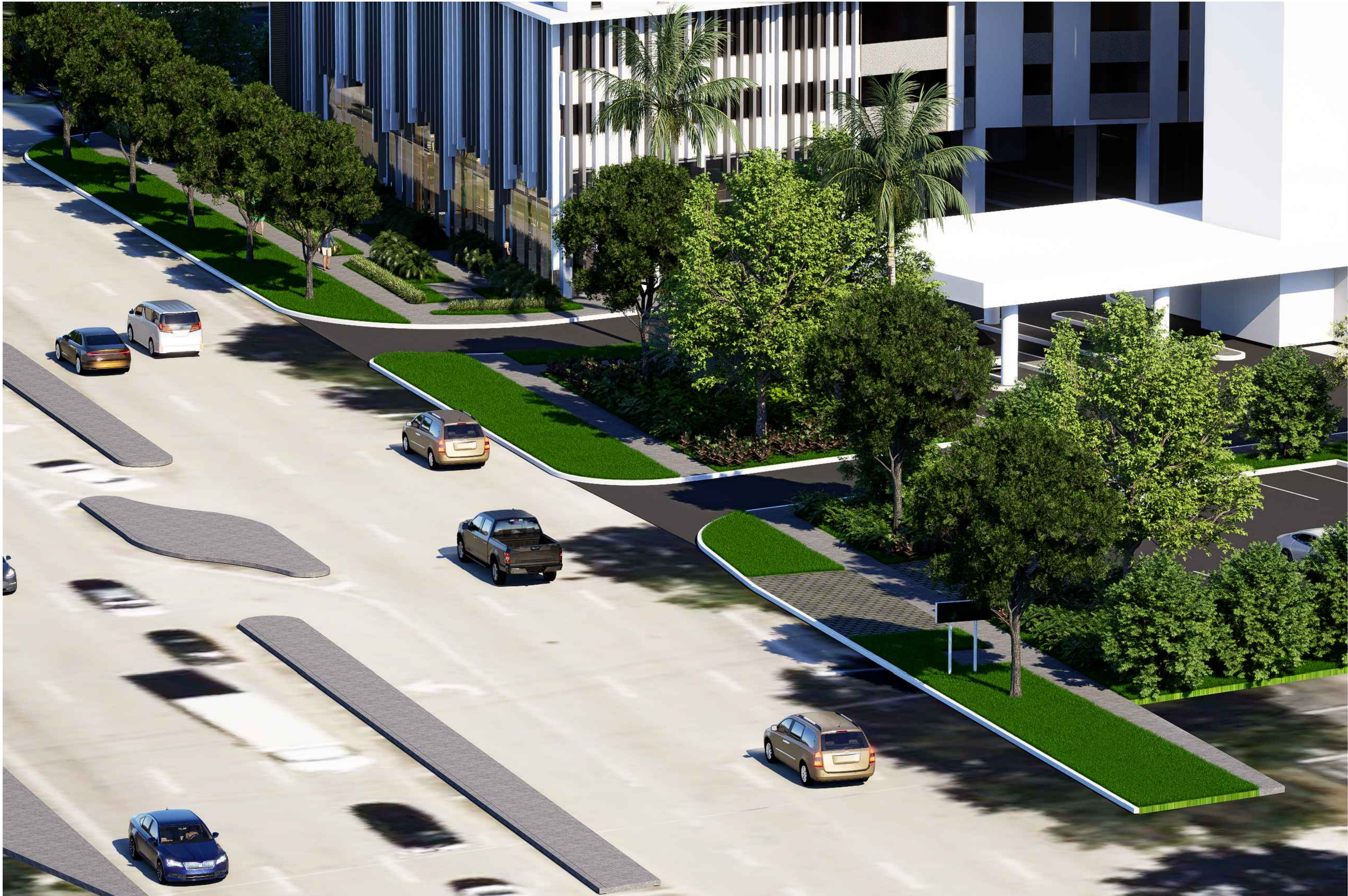
FIRE TRUCK ENTRANCE ON FEDERAL HIGHWAY